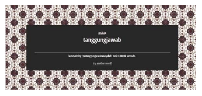
Figure 3. Display of Successful Lemmatization

When a lemmatization process is successful, then Figure 3 will be shown; however when the lemmatization process returns error, such as lemma not found, then Figure 4 will be shown instead.