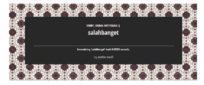
Figure 4. Display of Failed Lemmatization

Based on 25 articles in 10 categories captured from Kompas.com, the results are summarized as seen in table 7 and 8.