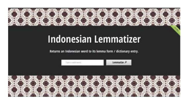
Figure 2. Main Display of Indonesian Lemmatizer

The algorithm was implemented to a simple web application, built in PHP and using MySQL database. The user is asked to directly input the desired word without preparing the batch files. The screenshot is shown in Figure 2. Basically, an input is supplied to the application, and an output will be shown as result.