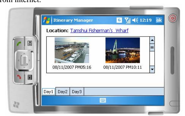
Figure 3. Snapshot of the interface of wizard runs on mobile devices.

Figure 4 illustrates that the user is selecting a picture to display its detail in a larger window adding text notes and audio description is also available in this mode. Comments or other information represented in text will be important clues for discovering related information from internet.