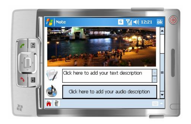
Figure 4. Adding user comments to captured images.