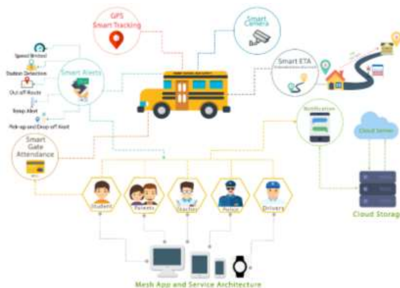
Fig. 1. Process of the smart bus management system using mesh app and service architecture.

The third component is the cloud server. It provides storage based on the integration of the users on mesh applications as shown in Fig. 1.