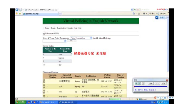
Figure 3. A trainee creates a scenario and starts VPIE training with another qualified participant.

VPIE training is implemented through a platform developed by Microsoft Visual Studio 2005 asp.net(c#) to realize the following functions: A trainee registers with his/her police ID and logs in the next time, selects a scenario from the Scenario Base or creates a new scenario, establishes requirements for the potential virtual partner(s) in English proficiency, major, even gender preference, starts fulfilling the virtual task or service by typing, audio or visual chat when other participants agree to act the virtual roles, or cancels all the requirements and takes a part in another scenario available. See Figure 3: