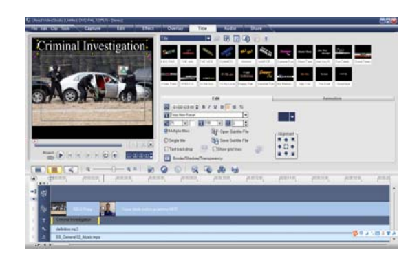
Figure 2. Transcript developing with Ulead Video 11.

Integrating original police transcripts into curricular learning is another feature. A transcript refers to a record of a call to 911or a policing event. Efforts are made to resume the context of the event so as to strengthen language experiencing. First, through browsing official crime reports, visiting police websites, searching some of the relevant key words on Google or obtaining from foreign police departments, sufficient textual, audio or visual data are collected and analyzed. Then explanations, titles are added while repeated, irrelevant contents are deleted with Word 2007, PowerPoint 2007 and Ulead Video Studio 11 for those typical transcripts with standard use of policing phrases. The first phase edited textual transcripts is either the reading material of Case study or the scripts for second phase audio and visual courseware development. The scripts are read or acted by some native English speakers and recorded by audio development tool cr-cooledit or DV, then edited with Ulead Video Studio 11 to add sound effect, titles and explanations as shown in Figure 2. Background information and discussion topics are attached to the transcript for further comprehension and consolidation.