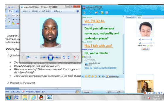
Figure 4. A witness answers a police officer's questions and opens the sent file to describe the suspect.

Participants see real appearance of one another in a visual chat, this is especially disadvantageous to a training among acquaintances, but the advantages of visual chat are, first of all, body language like facial tics, eye movements and hand gestures can reveal the other's personal traits and genuine thoughts; secondly, proofs, clues or any other objects can be shown through the camera. Compared with the visual chat, communication through typing and audio chat is more suitable for the VPIE training. See Figure 4 for details of the training process as illustrated in the scenario Questioning a witness implemented via QQ international 1.2.